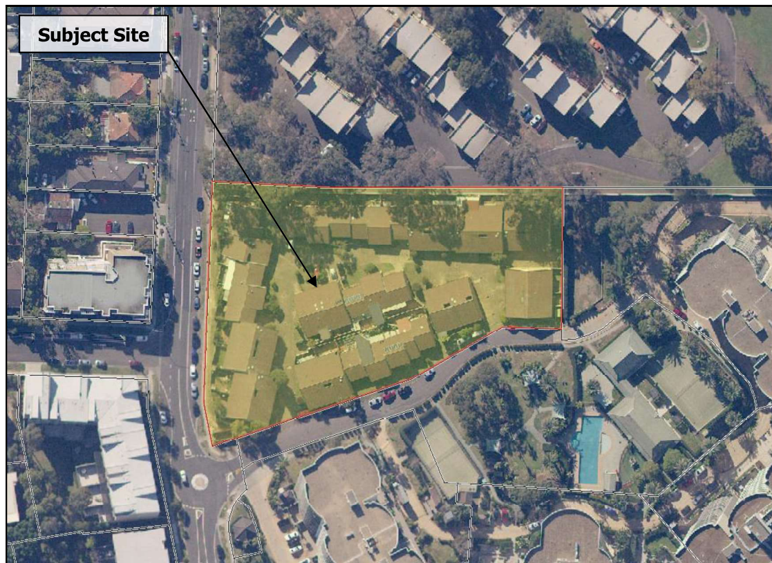
Figure 1. Existing Site Development (SIX Maps 2019)

Amendment to Parramatta Local Environmental Plan 2011 for Additional Building Height, Additional Floor Space Ratio and Additional Permitted Use for Short-Term Accommodation 93 Bridge Road, Westmead (SP 31901)